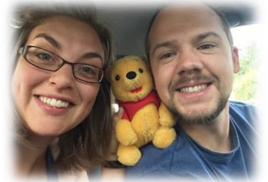
Going on an "Expoition" (as Pooh Bear would say)