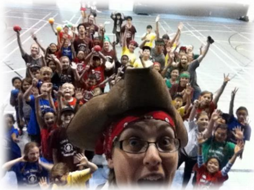
Leading Games at Church Day Camp (2016)