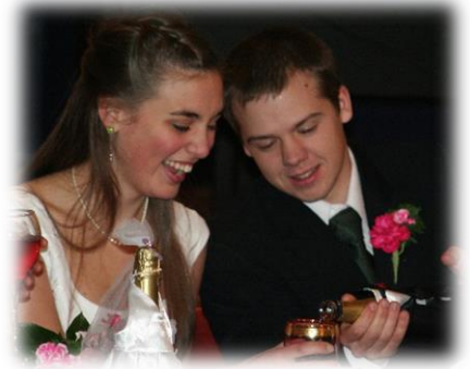
Our Wedding Day (2008)

Hello! Thank you for taking the time to look at our profile. We know that you have some really difficult decisions to make and we are so grateful that you're considering this really exciting, challenging journey of adoption!