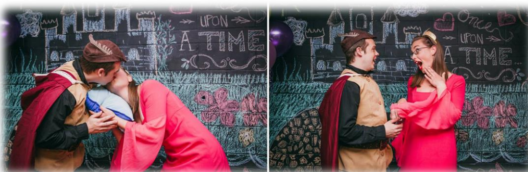
All Dressed Up for a Disney Themed Youth Event (2015)