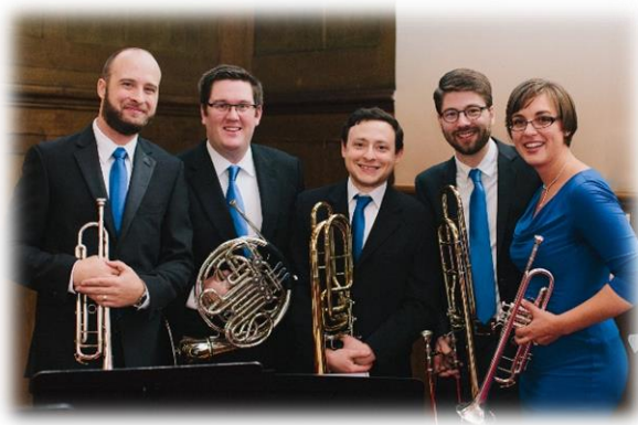
A Few Brass Buddies (2016)