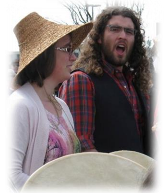
Brother at Pole Raising (2017)

Indigenous perspective. She has spent the last few years becoming more involved in and knowledgeable about her Haida heritage and engaging in discussion about Indigenous social justice issues. She loves Star Wars and Pixar, listening to jazz or electronic music, and hosting parties. Coffee dates, a good doughnut, and dark chocolate are three of her favourite pastimes.