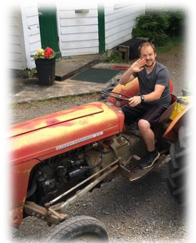
Directing Summer Camp (2017)