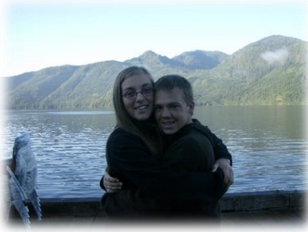
A Visit Back to Where We First Met (2007)