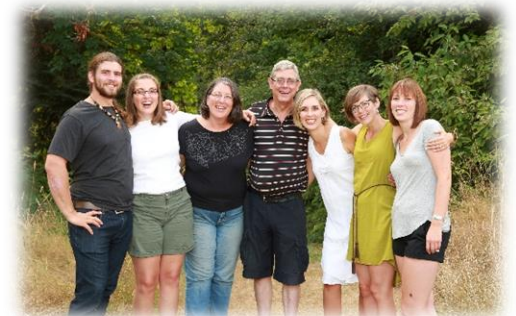
Parents, Most of the Siblings, and Some of the Nieces and Nephews