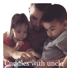
Cuddles with uncle